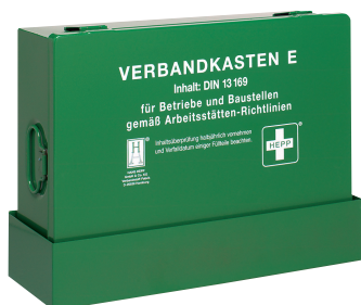
Ref. No. 45210