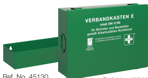
Ref. No. 45130