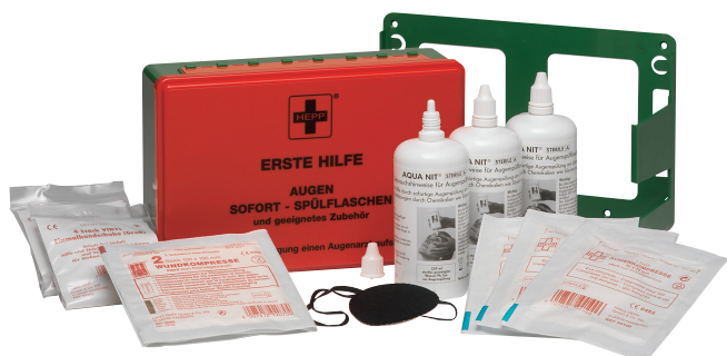
Ref. No. 91095

The German occupational health insurance institutions stipulate for most factories only the keeping of first-aid material in accordance with the requirements of DIN 13 157 and DIN 13 169. Large companies however, because of the requirements of the occupational health insurance institutions for health and safety at work, must have in addition stretchers and fire blankets ready for immediate use in an emergency. In our range we also have special articles for individual industrial areas (e.g. laboratories, chemical industry) such as our first-aid box "Eyes", which is designed for immediate initial treatment of injuries around the eyes.