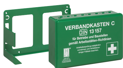
Ref. No. 45120

Our product portfolio is rounded off by additional materials for manual workers, the first-aid box "Eyes", stretchers and fire blankets.