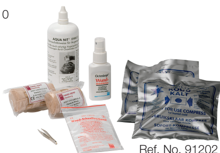
Ref. No. 91202