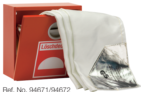
Ref. No. 94671/94672